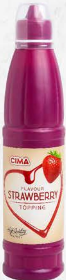
Strawberry 900 g