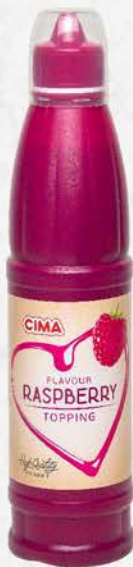
Raspberry 900 g