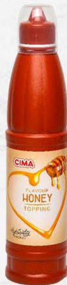
Honey 900 g