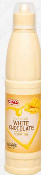
White Chocolate 850 g