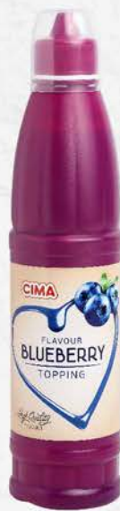
Blueberry 900 g