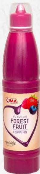
Forest Fruit 900 g