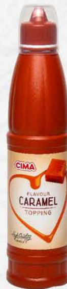
Caramel 900 g