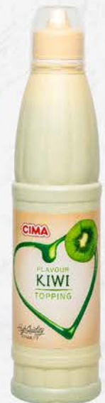
Kiwi 900 g